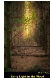
Week 50 'Early Light in the Wood'