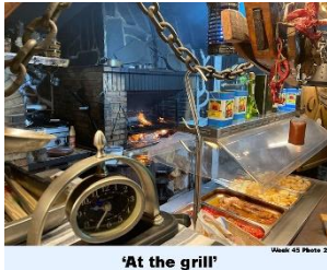
Week 45 'At the Grill'

Here are just some of photographic entries from their final weeks: