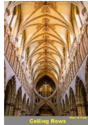
Week 46 'Ceiling Rows'