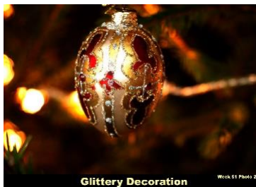
Week 51 'Glittery Decoration'