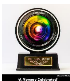
Week 52 'Here's to Christmases to Come' & 'A Memory Celebrated'