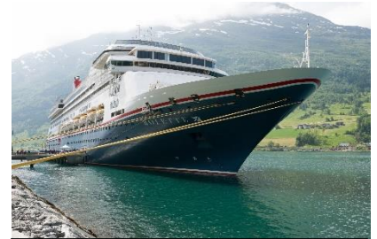
Our ship the Bolette

This was also considerably cheaper, especially as you consider that all meals were included. We took the plunge and booked with Fred Olsen and the cruise was to depart from Liverpool. This turned out to be a good choice as the port was easy to get to with secure car parking. Also, the other advantage was the ship route took us up between the outer and Inner Hebrides and we got some magnificent view of the islands. There was plenty to keep us occupied on the journey including various talks from experts on a wide range of subjects. I was impressed with the "Englishness" of the ship, down to the fact that I could have Adnam's Ghost Ship or Spitfire beer!!